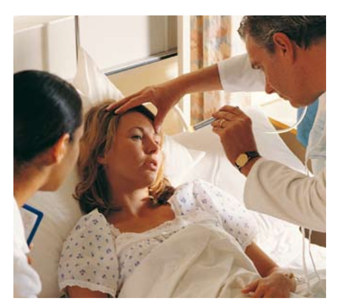
Adult General Ward